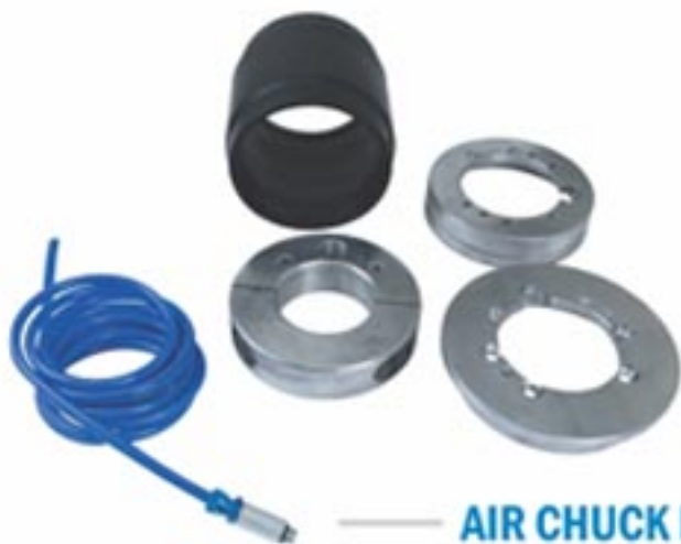
AIR CHUCK PARTS