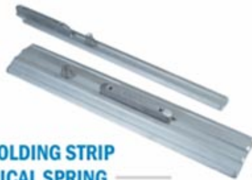
LUG HOLDING STRIP & CONICAL SPRING