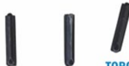
TORQUE CHUCK LUG & THRUST CHUCK LUG